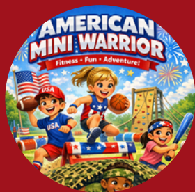
American Mini Warrior Physical Fitness