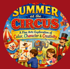
Summer Circus Art Exploration

Take the Stage in a two week theater class!