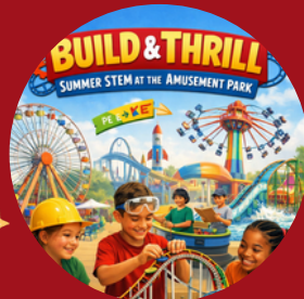
Build & Thrill STEM!