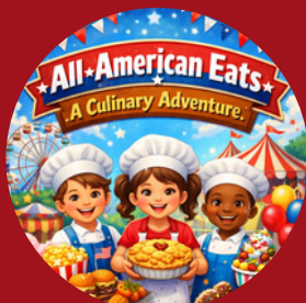
All American Eats Culinary Arts!