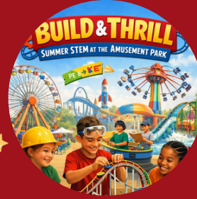
Build & Thrill STEM!