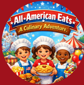
All American Eats Culinary Arts!