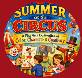
Summer Circus Art Exploration

Take the Stage in a two week theater class!