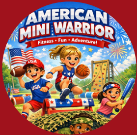
American Mini Warrior Physical Fitness