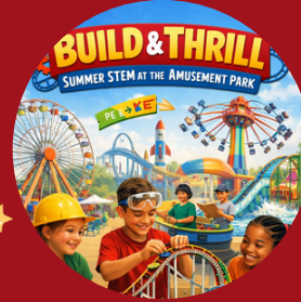
Build & Thrill STEM!