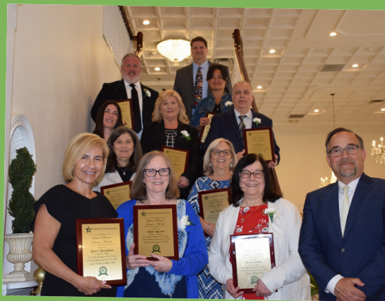
SCOPE 2023 School Board Service award recipients.