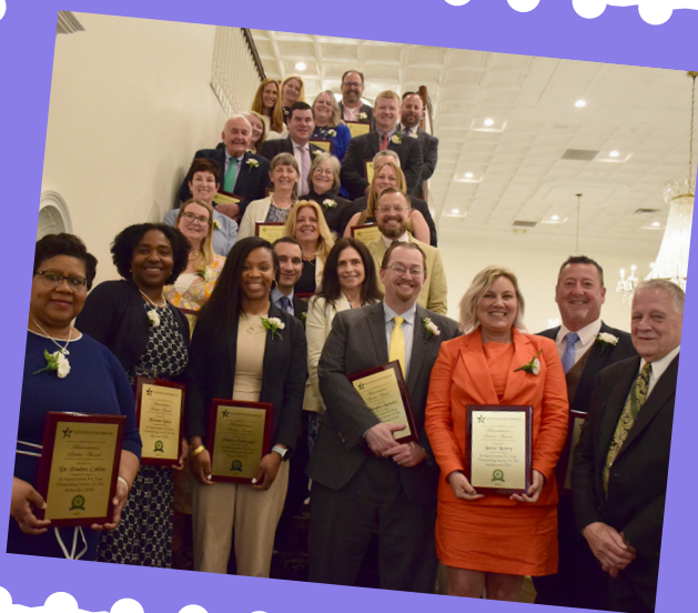
SCOPE 2023 Administrator Service award recipients.