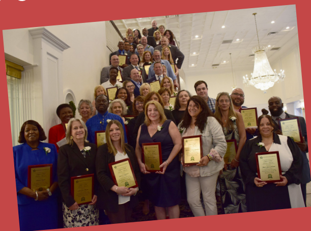
SCOPE 2023 Support Staff Service award recipients.