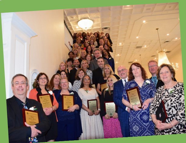
SCOPE 2023 Teacher Service award recipients.