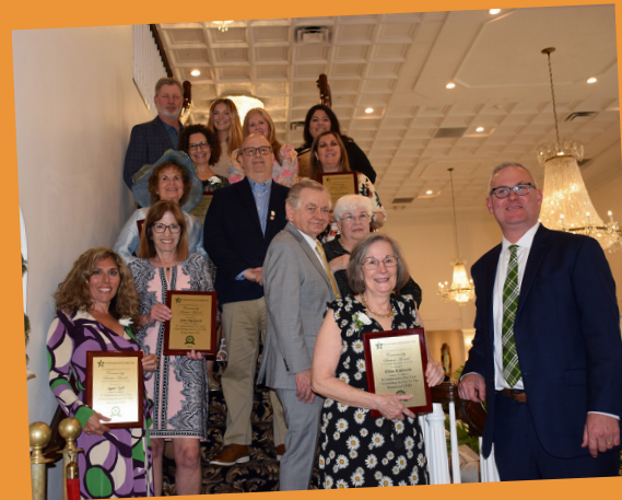
SCOPE 2023 Community Service award recipients.