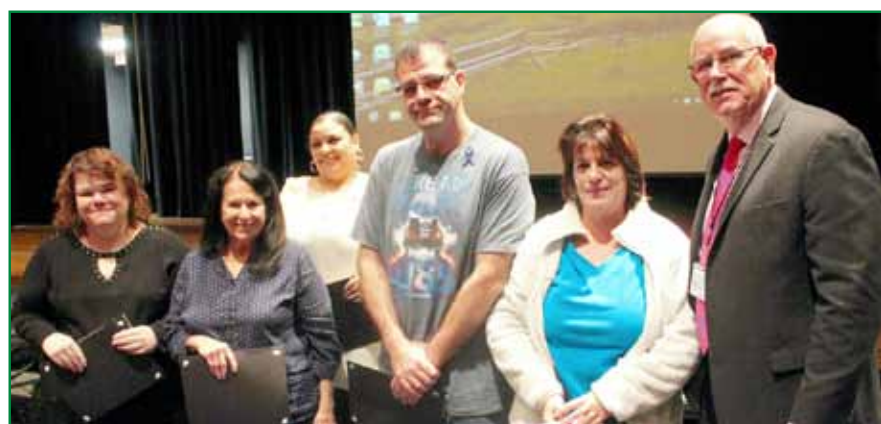
Employees who were honored for 15 years of service to SCOPE.