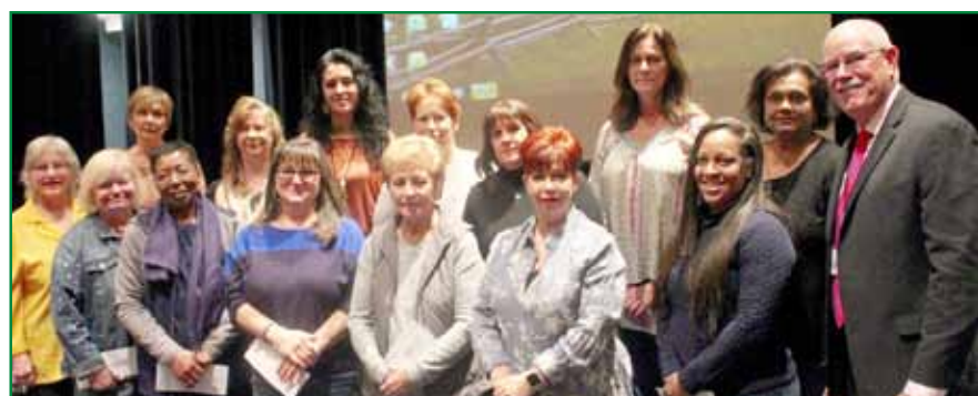
Employees who were honored for 10 years of service to SCOPE.