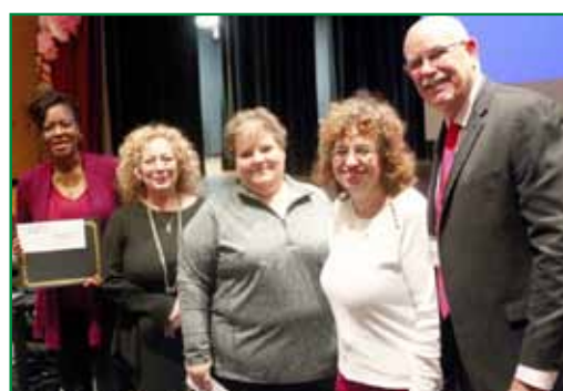
Employees who were honored for 20 years of service to SCOPE.