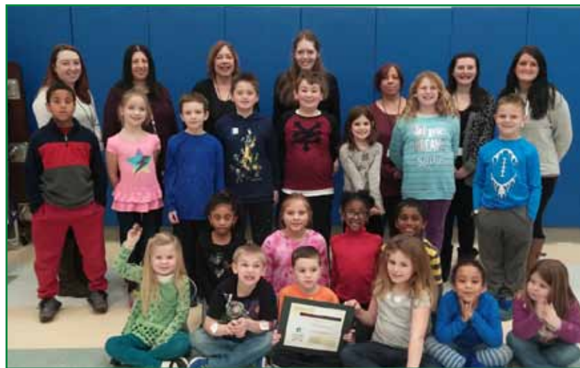
Longwood Ridge PM Program