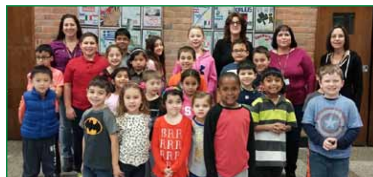
Hauppauge Bretton Woods PM Program

December Program of the Month: Deer Park – PM Program: Traditional activities