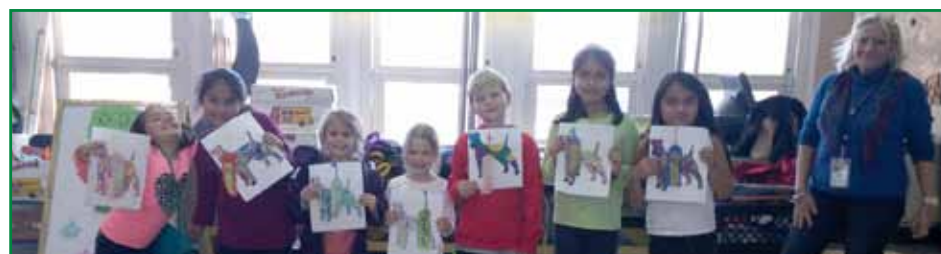
Hampton Bays After-School Program

November Program of the Month: Elmont – Stewart Manor PM Program: The staff is always seeking new and exciting projects for the children. In honor of Veterans Day, the children wrote letters to wounded soldiers at the