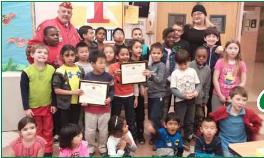
Elmont Stewart Manor PM Program