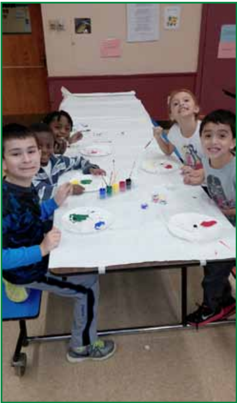
East Meadow Meadowbrook PM Program