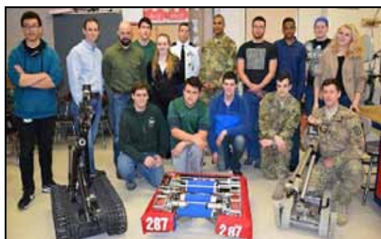
The Suffolk Army Recruiting Company brings EOD Soldiers to William Floyd HS in support of the First Robotics Competition, April 2016.