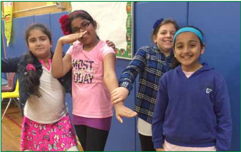
Hicksville School District Afternoon School-Age Child Care Program.