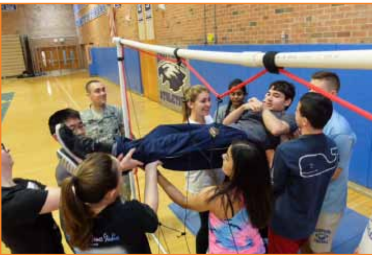
Hauppauge School District.