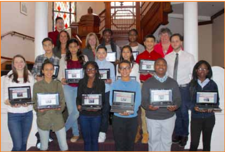
Amityville School District.

Suffolk and Eastern Suffolk BOCES, spoke about how they are using one-to-one computer teaching to enhance educational opportunities for students. Panelists also spoke about building an infrastructure to support the simultaneous operation of multiple digital tools, how to monitor and access student learning on an individualized basis, and how to identify solutions for most critical challenges. Following the success of this conference, plans are underway to offer a second conference during the 2016-2017 school year.