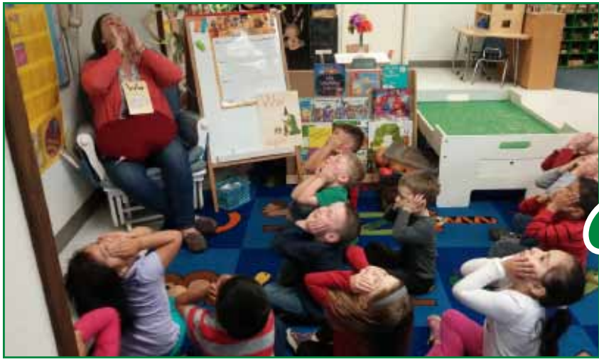
Riverhead School District UPK Program.