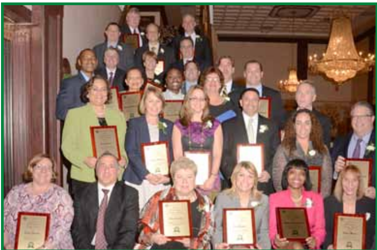
2016 Administrator Service Award Recipients