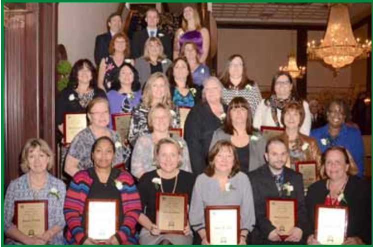
2016 Support Staff Service Award Recipients