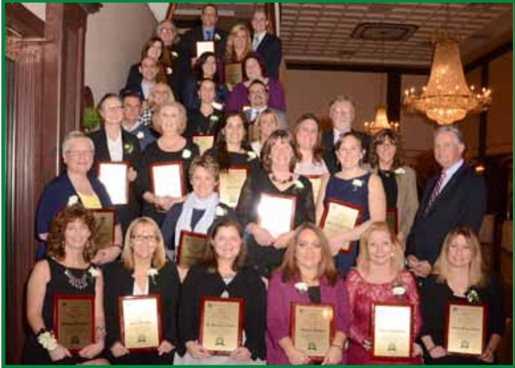
2016 Teacher Service Award Recipients