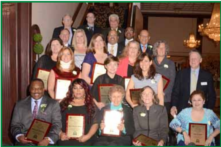
2016 Community Service Award Recipients